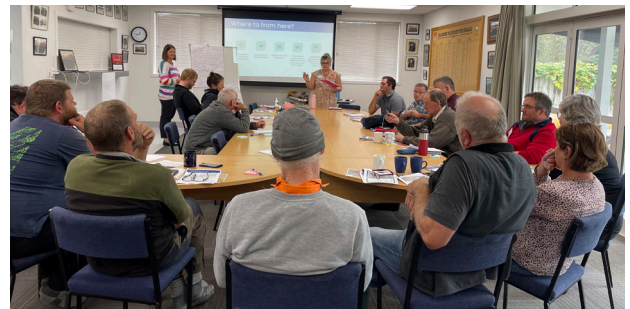
First cab off the rank - Coldstream/Innes Drain Group

Not sure when your meeting is? Your facilitator or farmer lead will be in contact once a date has been confirmed for each group. Highlight your calendar!